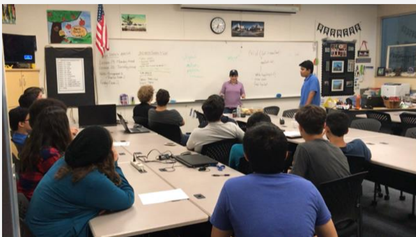
AP CSA student using Edhesive to teach Java to CNHS's Robotics Team